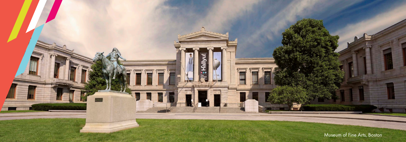
Museum of Fine Arts, Boston